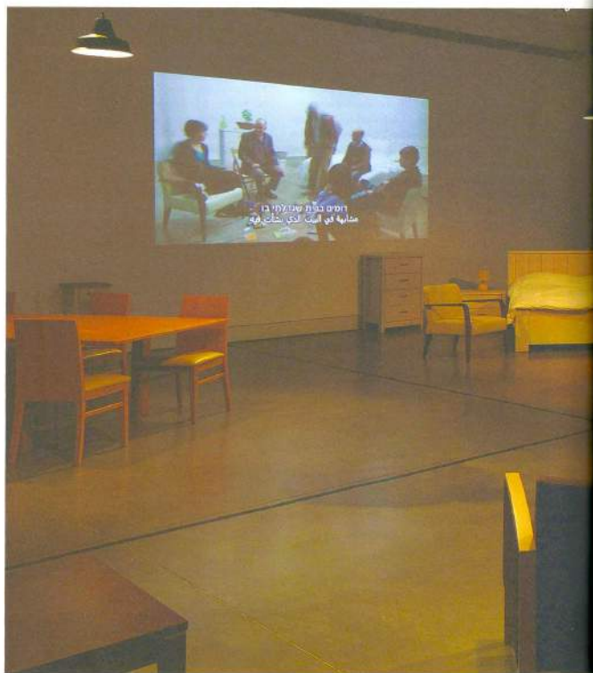
Installation shot of Einar Amir's "Our Best Intentions" in Petach Tikva Museum of Art