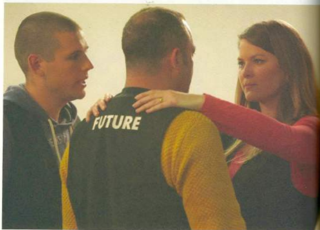
Ernst Amir, "Our Best Intentions", 2013, still image from video

EA: The space in "Our Best Intentions" is divided into four areas. The audience is invited to come into the space and choose in which area they would like to seat. Then, four group guides walk into the space. Each guide is coming from a slightly different professional field, all located in the spectrum between therapy and performing arts. Each of these guides is joining one of the four populated areas. Then, each of these guides in their turn will lead their group in a unique 15-minute workshop designed as a collaboration between myself and that specific guide. While one group is going through a workshop all the other three groups are watching them. After 15 minutes the spotlight fades out and fades in on another group that